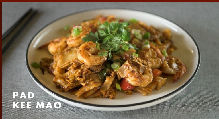
PAD KEE MAO

Famous Thai noodle dish with house special Pad Thai sauce, thin rice noodles stir-fried with egg, green onions, bean sprouts and ground peanut.