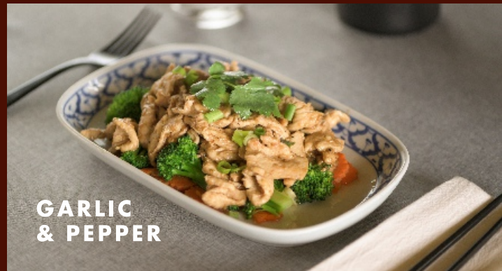
GARLIC & PEPPER

Pineapple, bell peppers, onions, carrots, tomatoes and cucumbers.