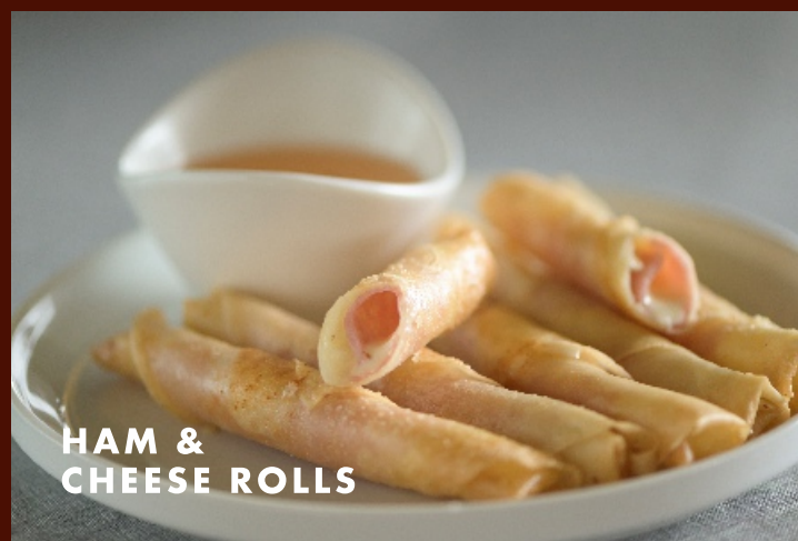
HAM & CHEESE ROLLS

Ham and Swiss cheese wrapped in egg roll wrapper and deep-fried served with sweet and sour sauce.