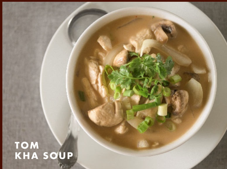
TOM KHA SOUP