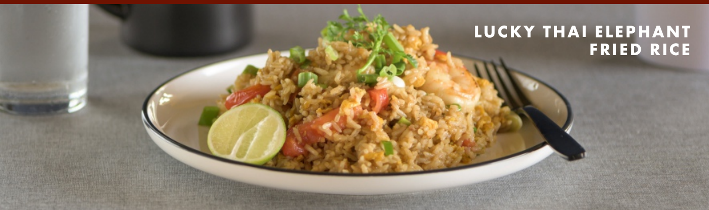
LUCKY THAI ELEPHANT FRIED RICE