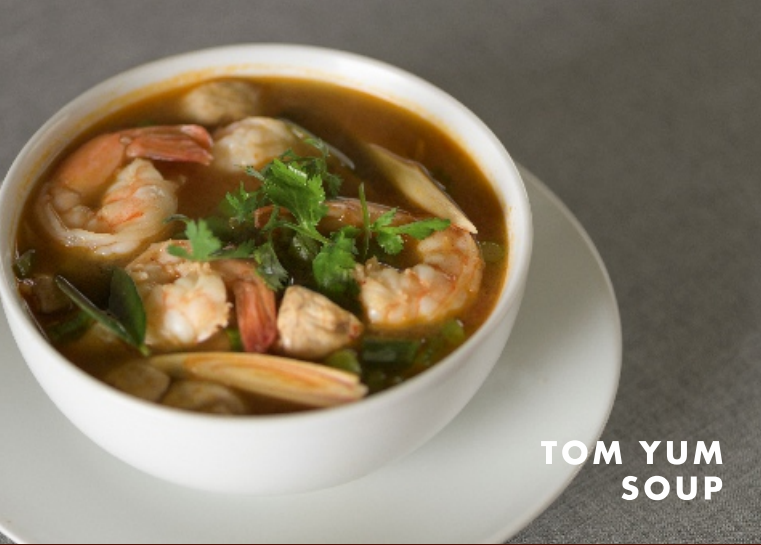
TOM YUM SOUP