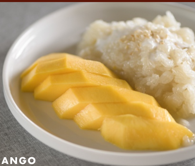
MANGO STICKY RICE

Sweet sticky rice with fresh mango on the side. (Seasonal)