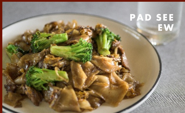
PAD SEE EW