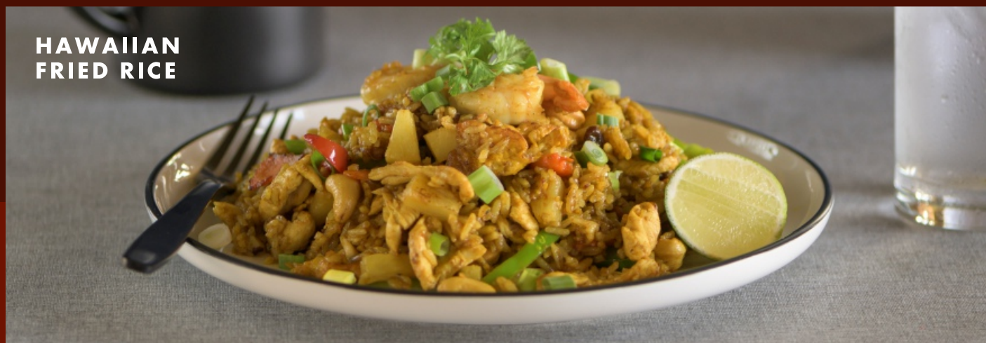
HAWAIIAN FRIED RICE

Combination of shrimp, chicken, pork and squid with egg, onions and tomatoes. Garnished with cilantro.