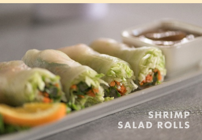
SHRIMP SALAD ROLLS

Non deep-fried. Fresh lettuce, tofu, carrots, cilantro, basil leaves wrapped in rice paper. Served with homemade peanut sauce. [Shrimp $9.95]